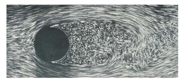
(b) a closer look at Re=2000 – patterns are identical as in (a) Courtesy ONERA pic. Werle & Gallon (1972) from An Album of Fluid Motion by van Dyke (1982)